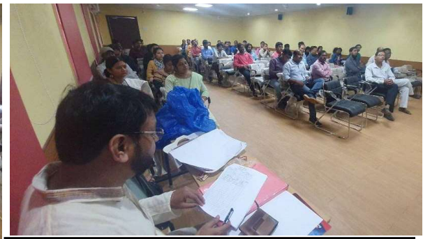
The Participants with keen attention to the speaker's keynote address